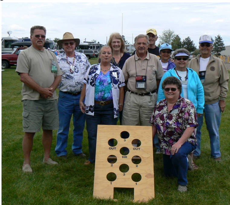
San Juanderer Team 3