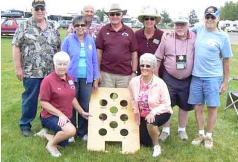
San Juanderer Team 1 CHAMPS!