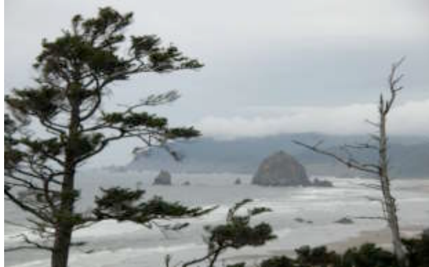
Haystack Rock 235' above sea level