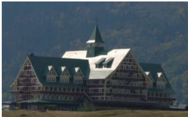
The Lodge at the Village in Waterton, Alberta Canada