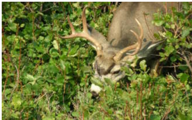
Mule Deer everywhere!