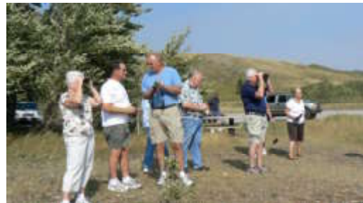
Looking at elk at the Canada side of Glacier National Park

After enjoying unusually warm weather all the way, the group arrived to Minot after driving in a windstorm. Rain poured down and the wind blew for days. The arrival and parking of the 13 coaches at the fairgrounds was commented on by the festival parkers as the best they had ever seen for a group our size!