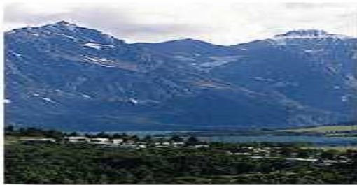
Our view of St Mary's Lake

At Deer Park in Spokane, members played a round of golf, washed clothes and enjoyed a pot luck dinner. Then it was off to Kalispell and Glacier National Park. The campground was located atop a hill, with a spectacular view of St Mary Lake. Two days were spent sight seeing, hiking and enjoying the features of the park.